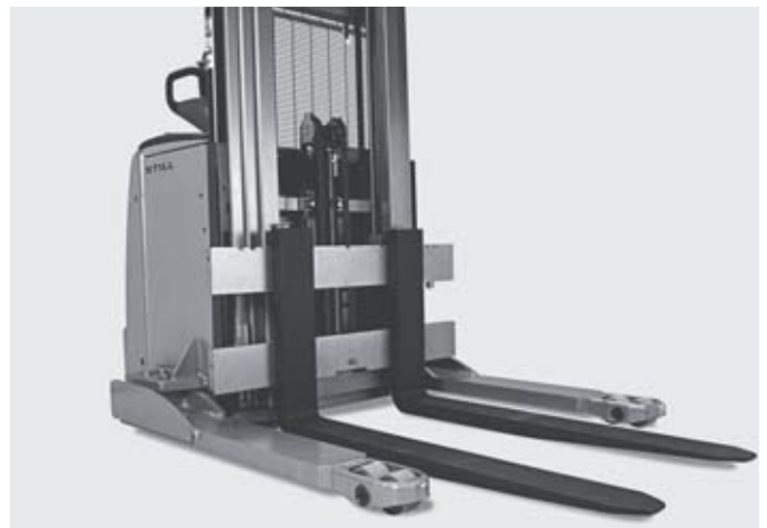
All-rounder: self-supporting and adjustable forks allow the handling of different pallet types