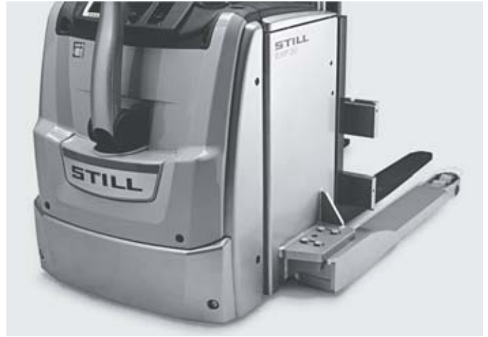
High availability: compact, robust frame design ensures durability