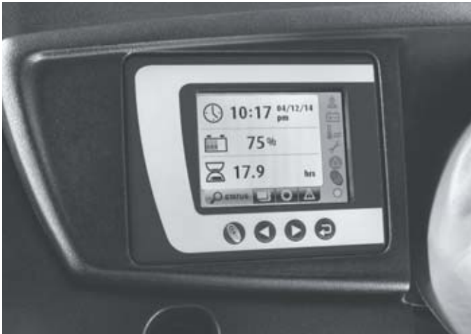
Everything in view, all the time: colour display with a range of language-independent symbols shows you all of the important functions at a glance