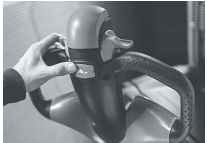
Precise in all situations: creep speed also makes it possible to manoeuvre in the most confined of spaces