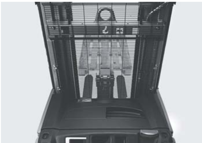
STILL free view mast always ensures the best view of the tips of the forks