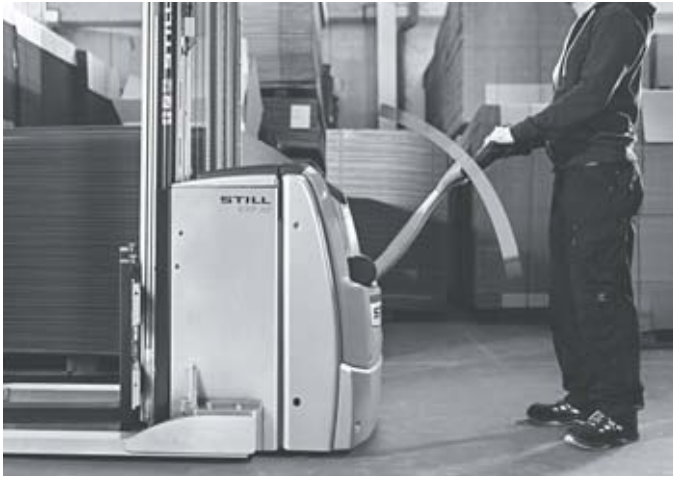
Safety in production: depending on tiller angle, speed is automatically adapted to the distance between the operator and the truck